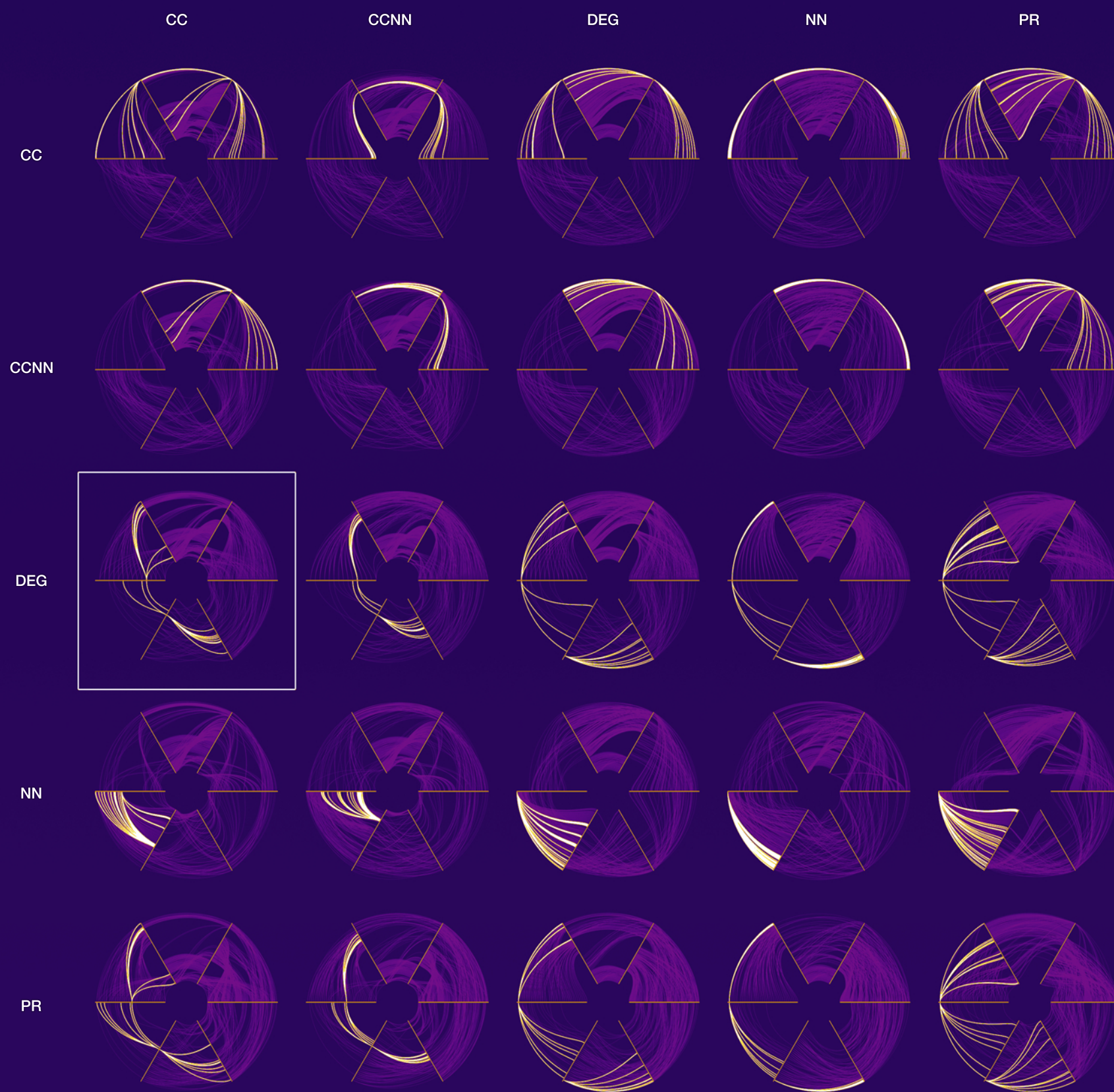
HIVE PLOTS FOR AXIS ASSIGNMENT: DEG AND NODE POSITION: CC