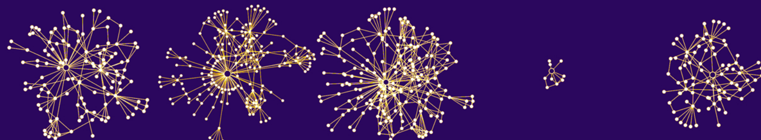
CYTOSCAPE ORGANIC LAYOUT OF SUBNETWORK FORMED BY MOST CONNECTED NODE AND NEIGHBOURS AND NEXT-NEIGHBOURS

Complex networks are notoriously difficult to visualize because their structure cannot be effectively communicated in a single image [1]. We propose that this can be achieved by multiple and independent visual signatures, each based on a different combination of structural properties. Visualization schemes based on global layout rules (e.g. force-directed) are of limited use for this purpose because they cannot be tuned to be sensitive to patterns in structural attributes, cannot be directly compared, and scale poorly. We present the concept of a hive panel , a matrix of hive plots [2], each created with different layout rules to specifically interrogate different aspects of network structure.